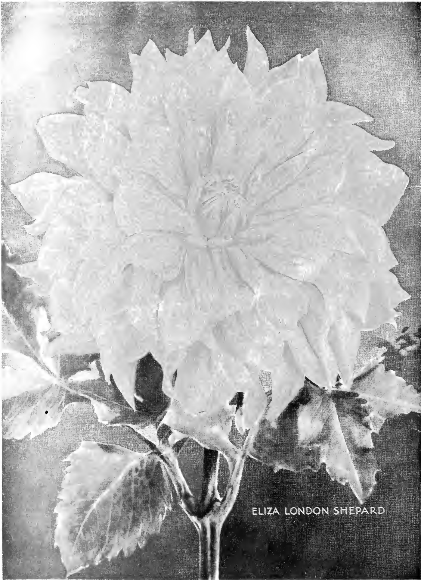
ELIZA LONDON SHEPARD